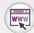
TELPAS Online Training Center

The training courses and calibration activities are grade-cluster specific. The instructional content for K–1 training differs substantially from that of the other grades due to differences in the ways that the domains of reading and writing are assessed.