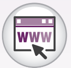
Test Security Oath

Test administrators must complete the general oath. General oaths should be printed and/or saved and provided to the campus testing coordinator. All oaths are required to be maintained by the district for a period of five years. The general Oath of Test Security and Confidentiality is available in the Security section of the Coordinator Resources .