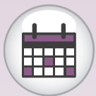
Calendar of Events

All K–12 ELs are required to participate in TELPAS, including students classified as limited English proficient (LEP/EL) in PEIMS who have parents who have declined bilingual/English as a second language (ESL) program services (PEIMS code C). ELs are required to be assessed annually until they meet bilingual/ESL program exit criteria and are reclassified as non-LEP/English proficient.