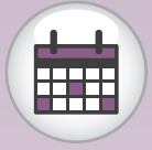
Calendar of Events